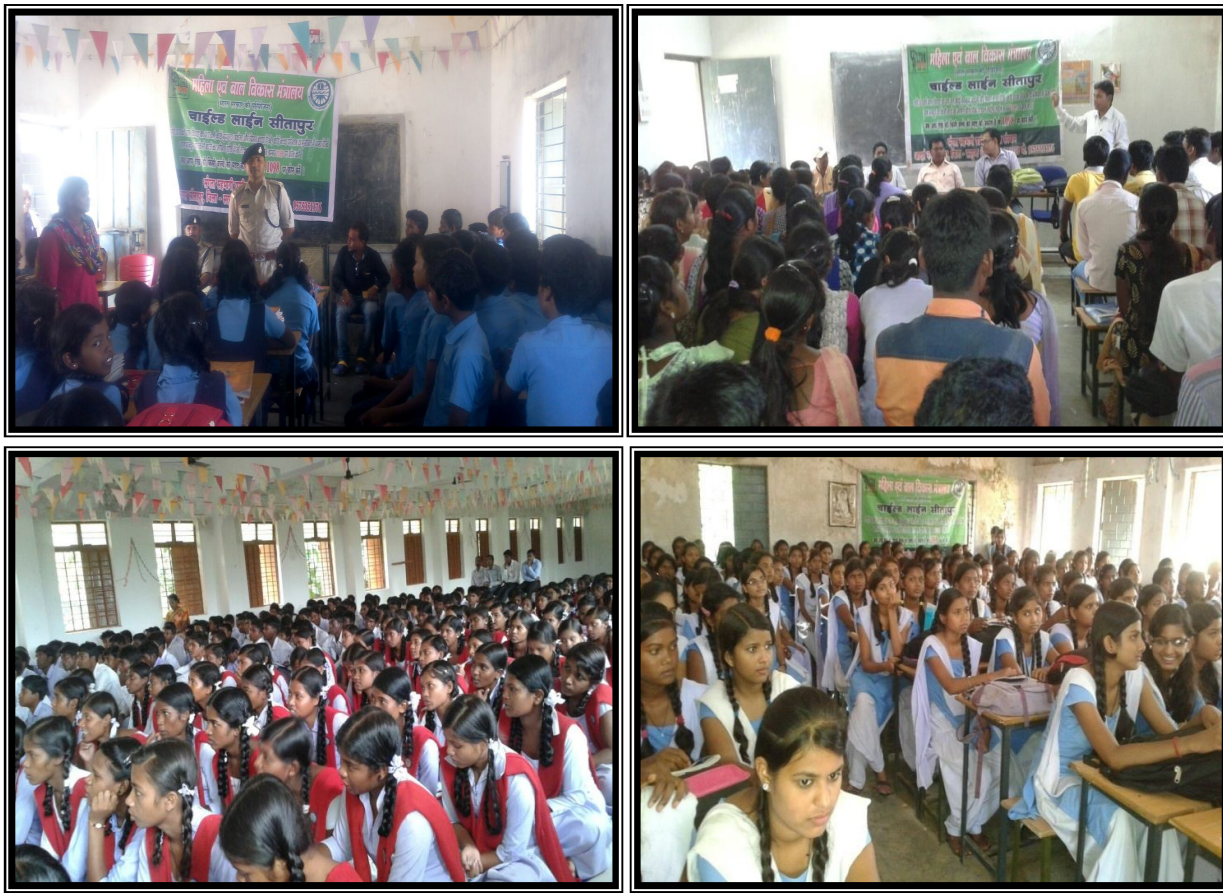
Above: CHILDLINE activities in progress.