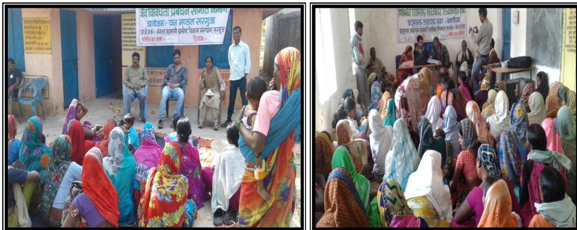
Above : Formation of BMCs in Progress

Under the Biological Diversity Act 2002, Organisation formed 16 BMCs at village Panchayat level with support of Surguja Forest Division for the purpose of promoting conservation, sustainable use and documentation of biological diversity including preservation of habitats, conservation of land races, folk varieties and cultivars, domesticated stocks and breeds of animals and microorganisms and chronicling of knowledge relating to biological diversity.