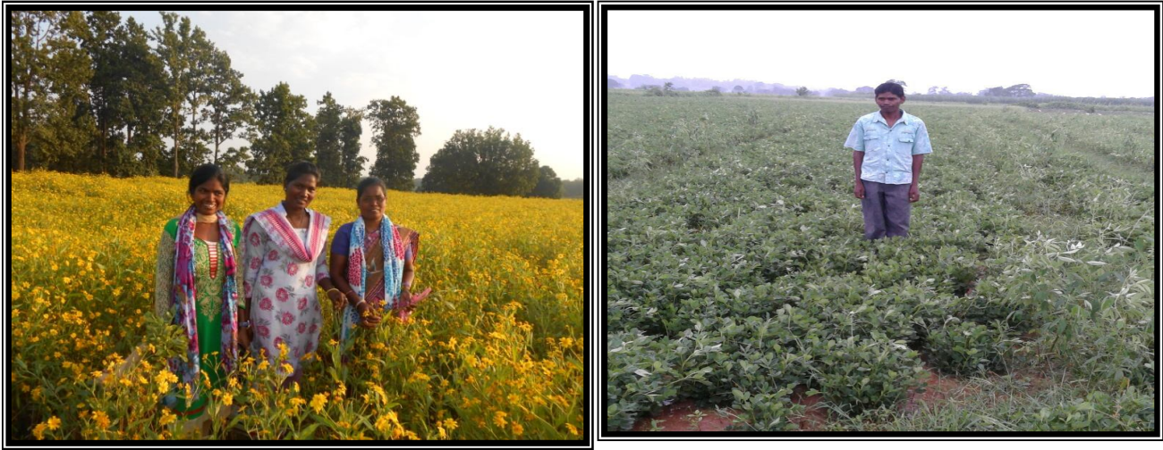
Above: Crop of Horsegram, Black gram, pigeon pea, ground nut and finger millets