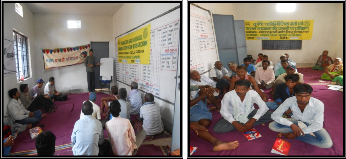
Above: Training on Agro-ecological farming & System of Crop Intensification in progress at village Lalitpur .