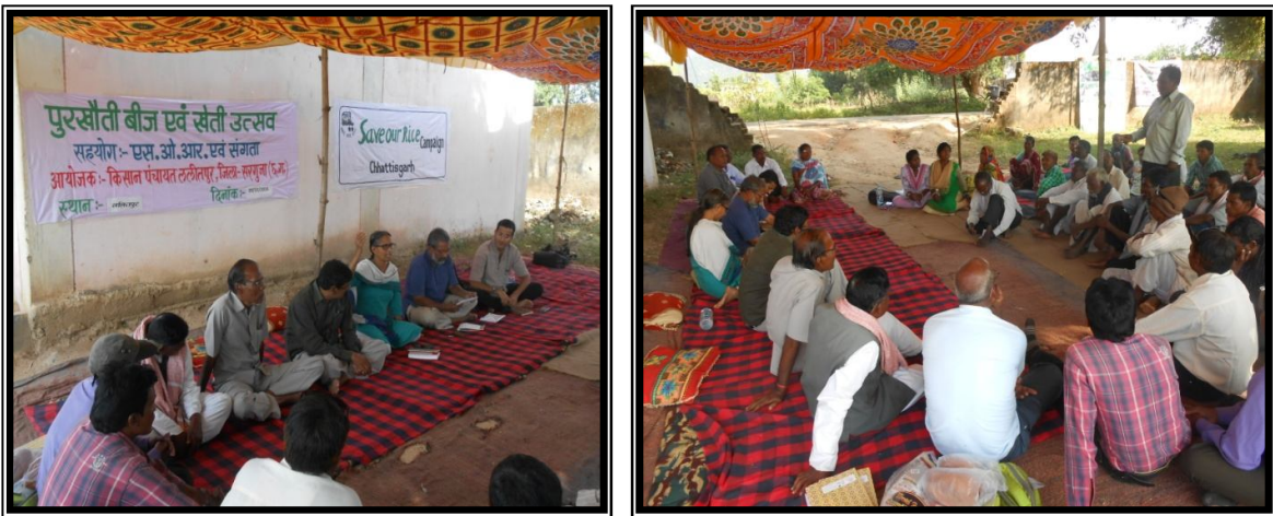
Above: Desi Seed & Field Festival in progress at Lalitpur village Sitapur Block of Surguja District.