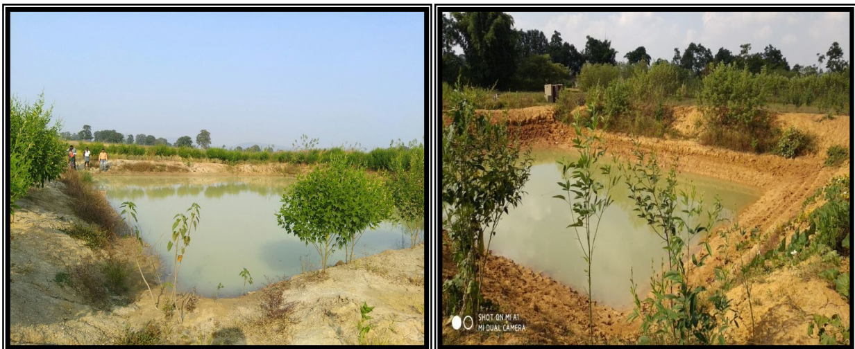
Above: Farm Pond constructed at Rajauti village village in IWMP-12

During the year 2016-2017 organisation constructed 6 Farm Pond for water harvesting and field bunding for moisture and soil conservation. Watershed committees and Self Help group Members trained for objective of watershed and its impact on livelihoods of community and ecology.