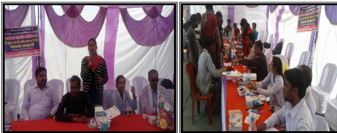
Above: Activities of Health camp in progress in TI project Korba.

under Registration of population, group discussion, identification of Hotspot and Street Plays health camp, Nukad Natak and group event etc.