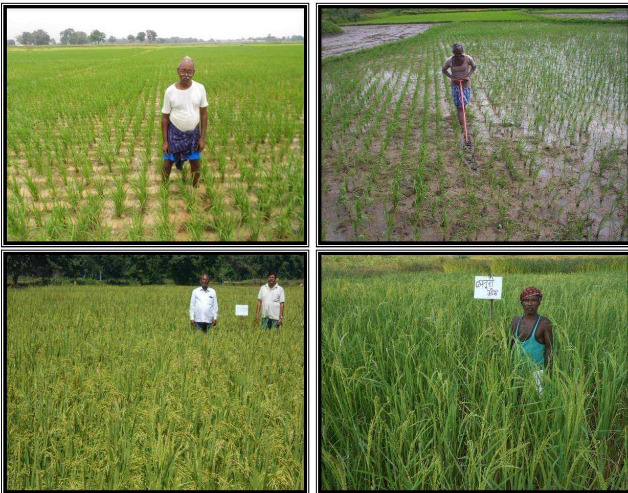
Above: : Cultivation of Paddy in progress through SRI Method by Farmers of Sitapur block of Surguja.

6 Kisan Mela organized in Which 434 farmers participated.